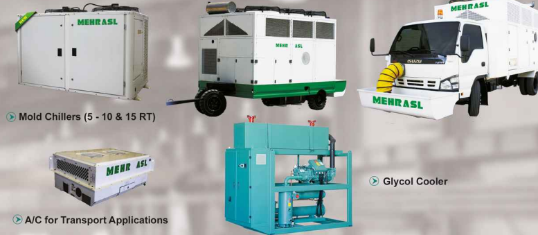
Mobile Pakaged Unit for Airplane 60~160RT