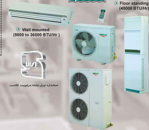
Floor standing (48000 BTU/Hr)