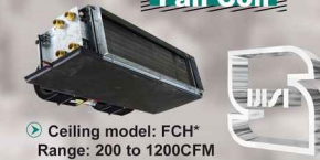
Ceiling model: FCH* Range: 200 to 1200CFM