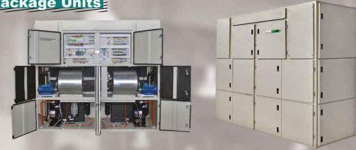
Unit Range of 5-30RT