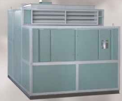
Remote Air Cooled Package Unit (RPC Type) Range: 15 to 100 RT