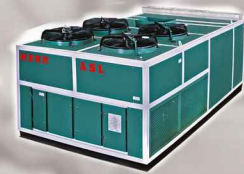
Air Cooled Package Unit (APC Type) Range: 4 to 100 RT